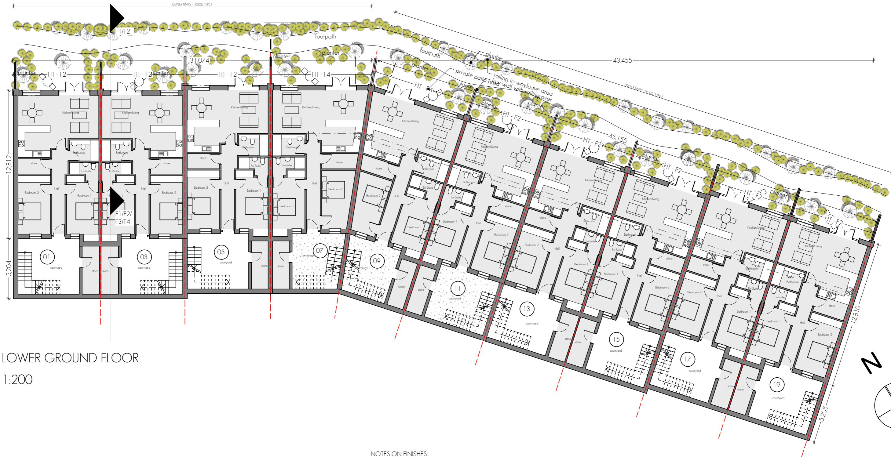
LOWER GROUND FLOOR 1:200